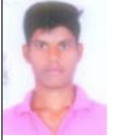
Photo of Student

College: J.S.P Mandals Arts and Science College,Gadhi (165)